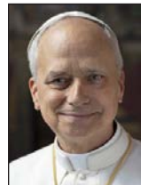
Leo P.P. XIV