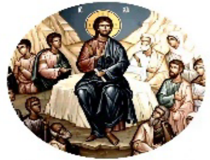
The Eight Beatitudes